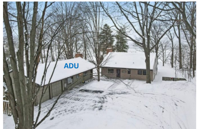
10975 Lakeshore Dr., GHT