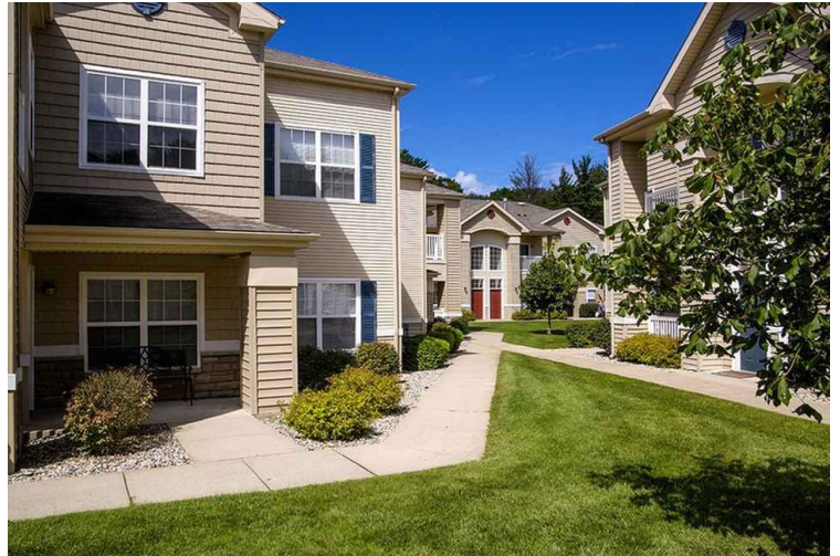
43 North PUD, Grand Haven