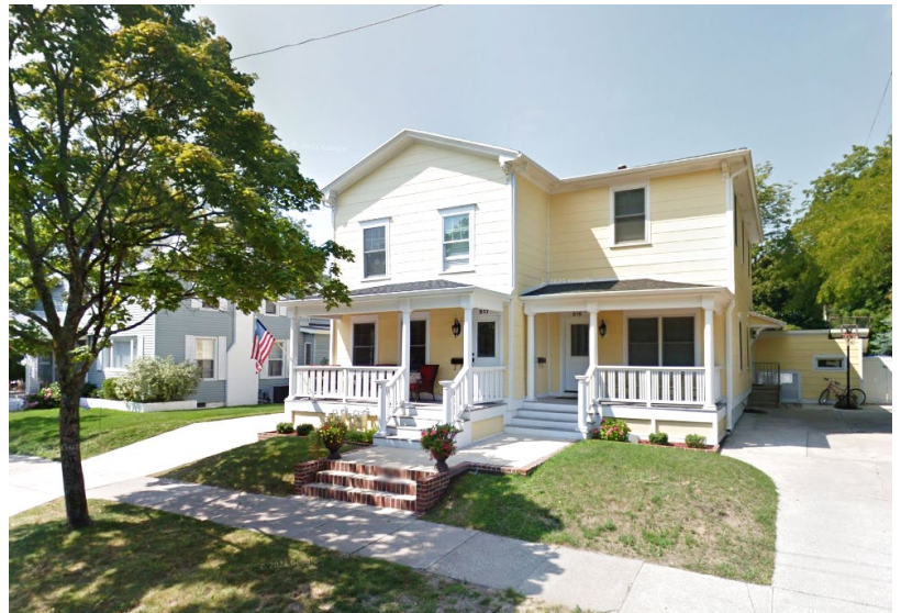
517 Sheldon, Grand Haven