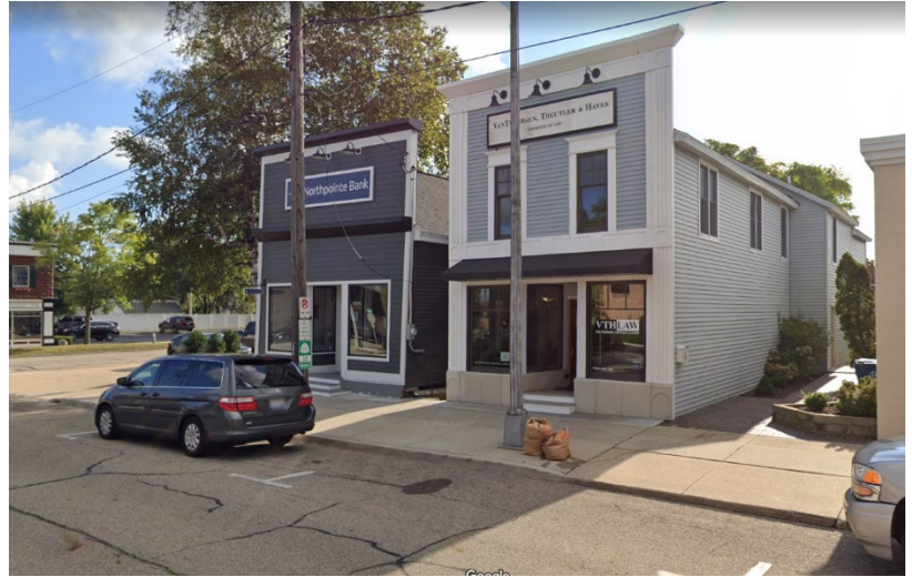
114 N. 3 rd St., Grand Haven