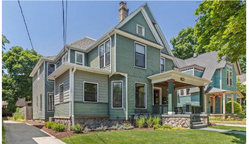
227 Henry Ave., Grand Rapids