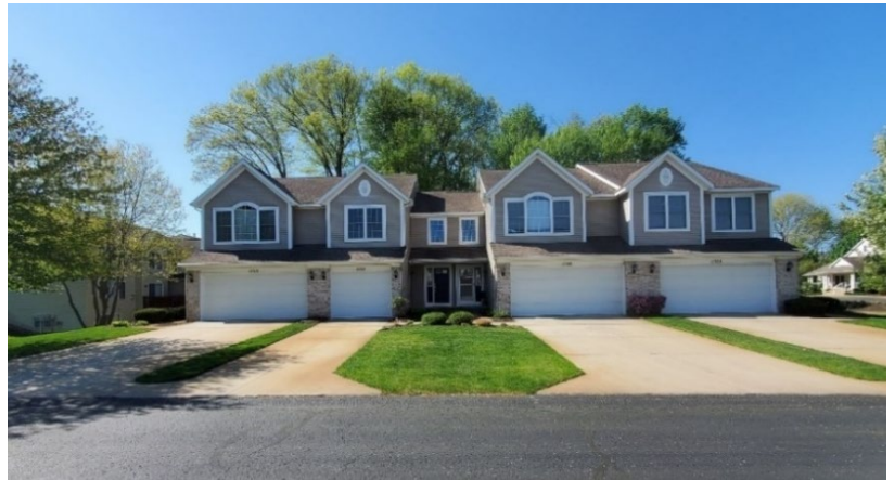
Hunters Woods PUD, GHT