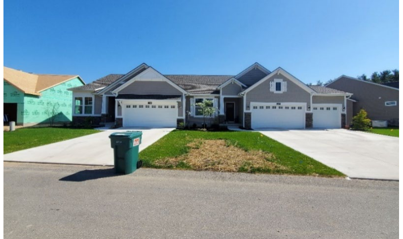
Lincoln Pines PUD, GHT