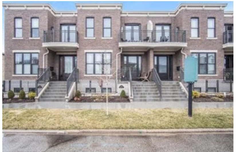
Franklin Flats, Grand Haven