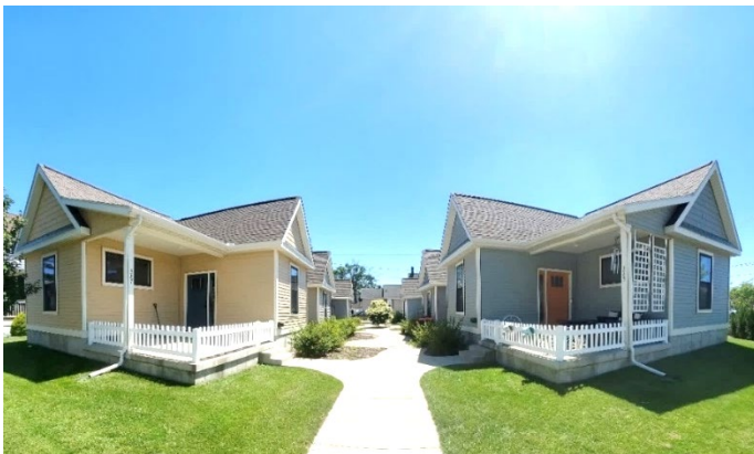
Central Commons, Holland