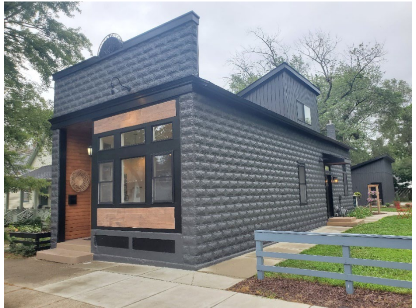
1322 Washington Ave., Grand Haven